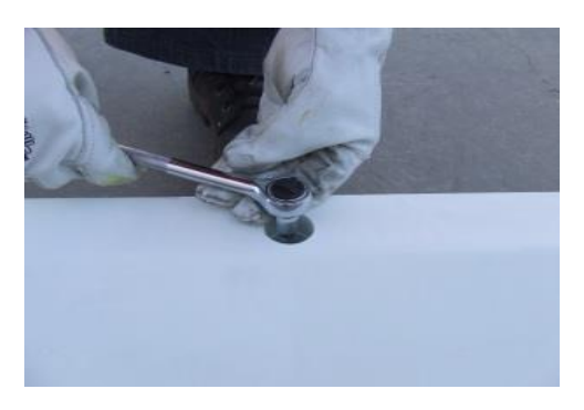
Page 2 - Only the copy on the Intranet is controlled - all other copies are uncontrolled

h) Finish tightening coach bolts using a ratchet socket wrench with a 17mm socket. Note: ensure this step is completed quickly as the epoxy will set too hard preventing tightening of the bolt.